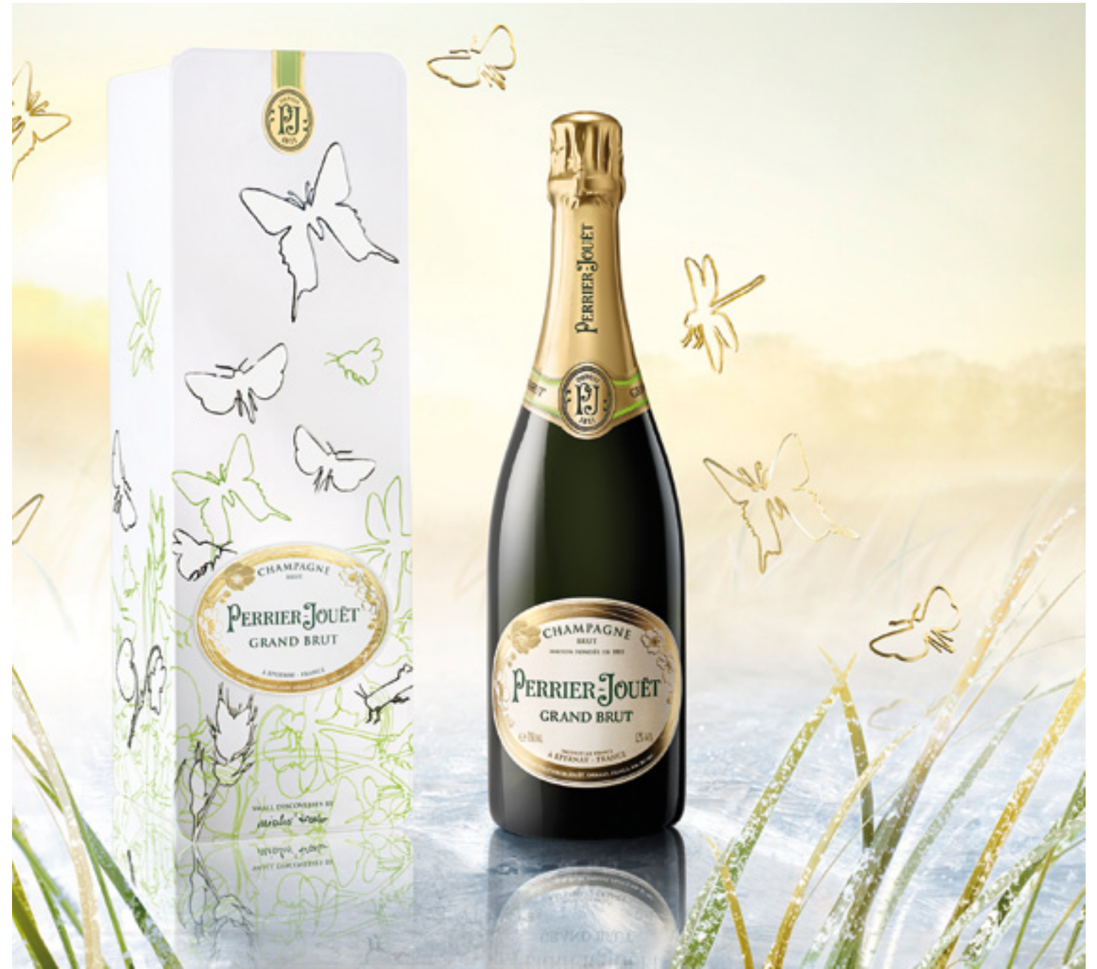
Small Discoveries by mischer' toxler Grand Brut